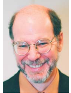
H. Robert Horvitz

Through genetic analysis of the nematode Caenorhabditis elegans , Dr. H. Robert Horvitz discovered and characterized many genes that play highly specific roles during animal development and in animal behavior. He defined genes that control specific aspects of cell lineage and cell fate, including the generation of cell diversity during development; the timing of particular developmental events; inter- and intracellular signaling; and pro-